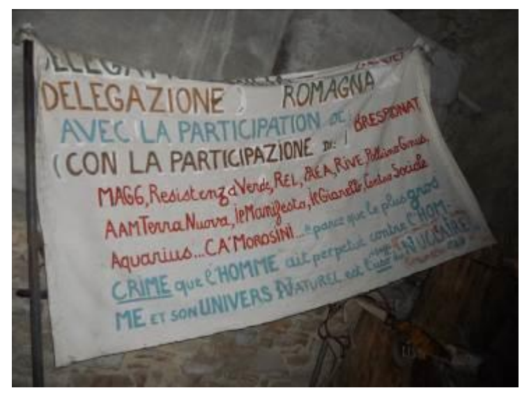
Banner for Nonviolent action

to burn their game weapons in front of the municipal building, in order to oppose war<sup>31</sup>.