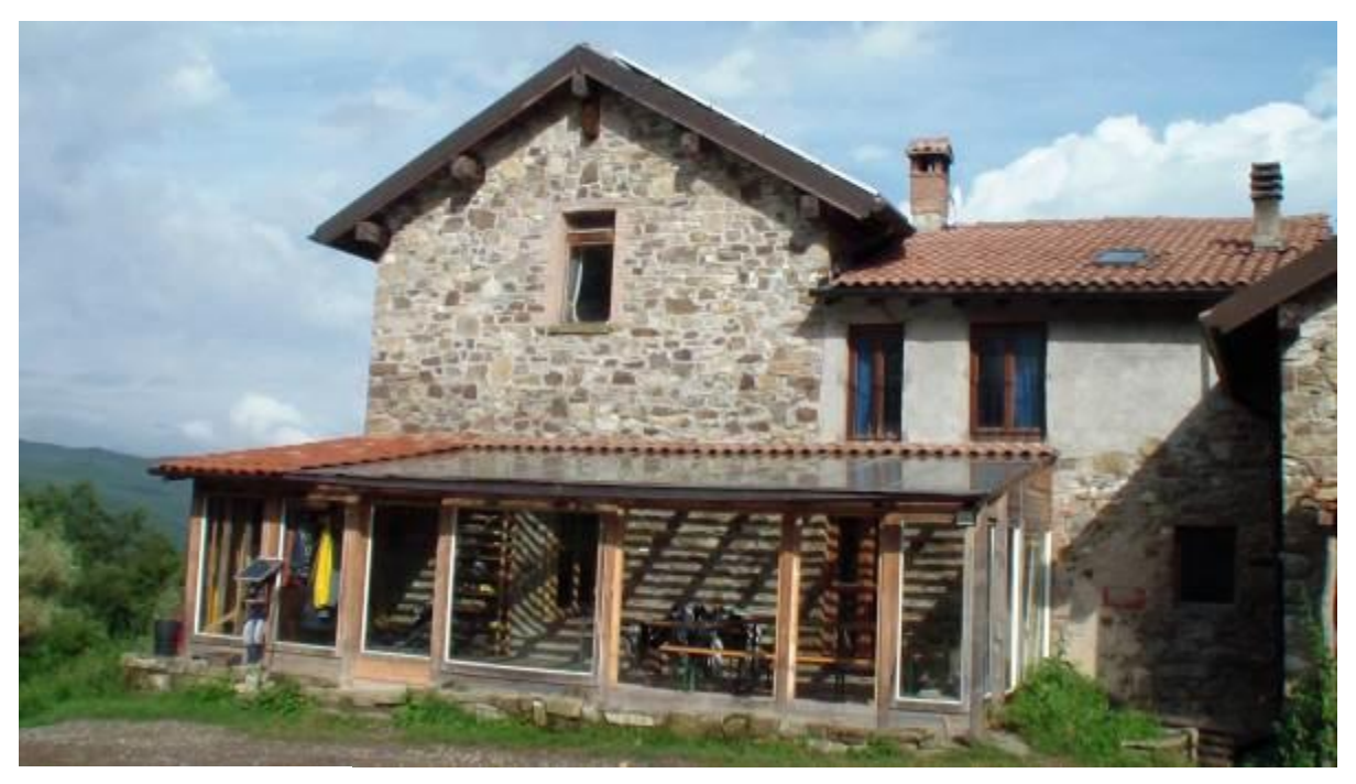
The former Common