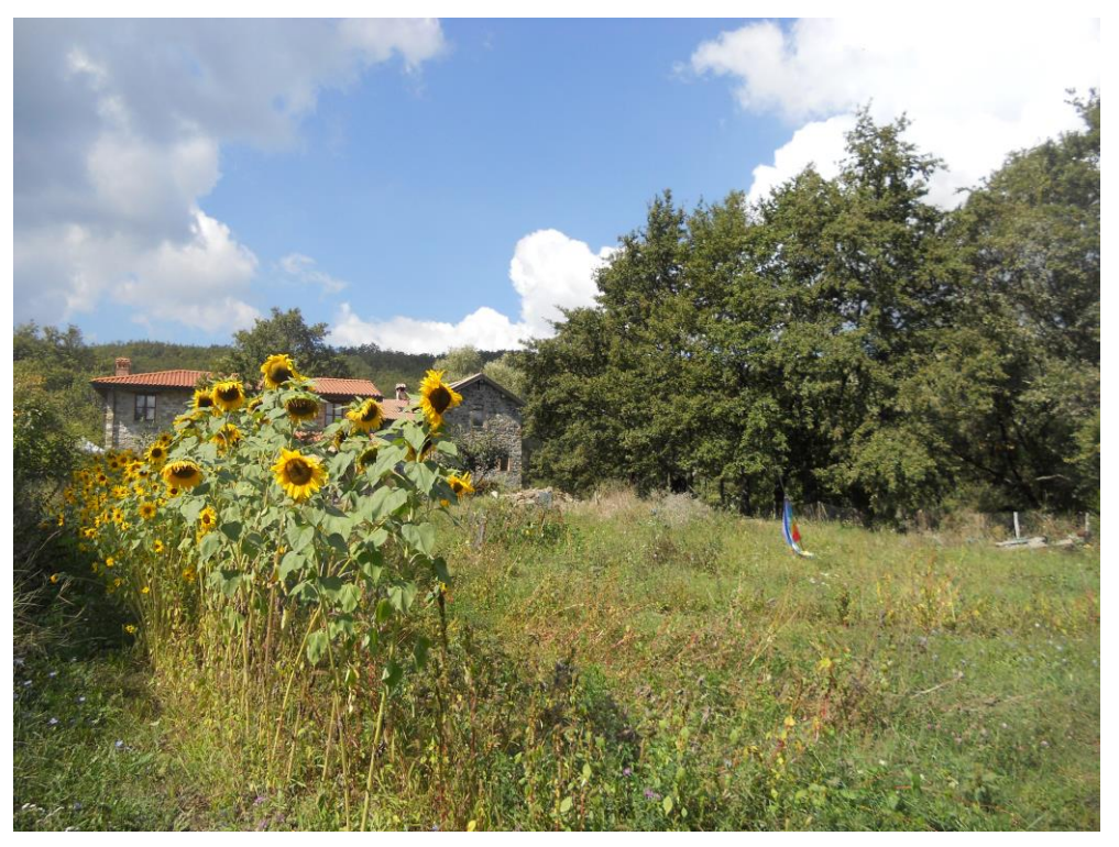
Granara garden and houses

Initially the idea was to create in Granara a permanent centre for environmental and health education. This aim was developed through the environmental education courses and activities proposed by the village. Then, the things have evolved and the art and the theatre have become important parts of Granara.